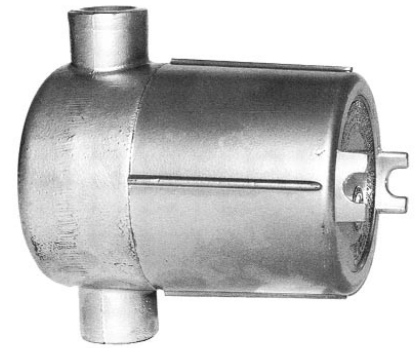
Figure 1. Model 1005 Pulse to DC Converter

Nutating Disc - with Transmitter model R-11, R-22C & R-25