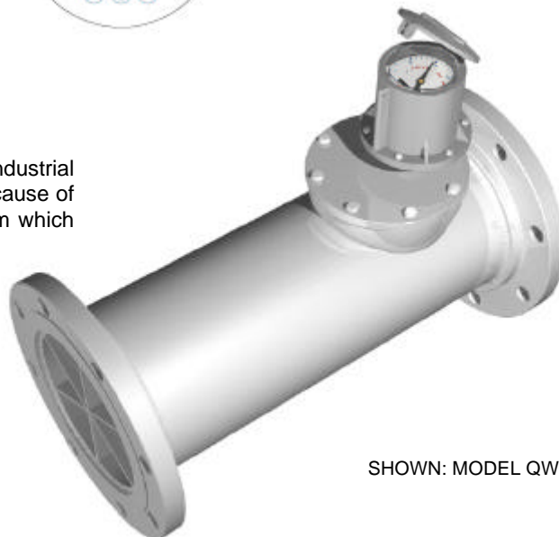
SHOWN: MODEL QW500