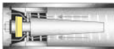
Reverse Flow By-Pass

NOTE: TK suffix represents standard test kit configuration. For reverse flow by-pass test kit, replace TK suffix with RT suffix.